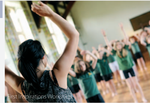
First Inspirations Workshop