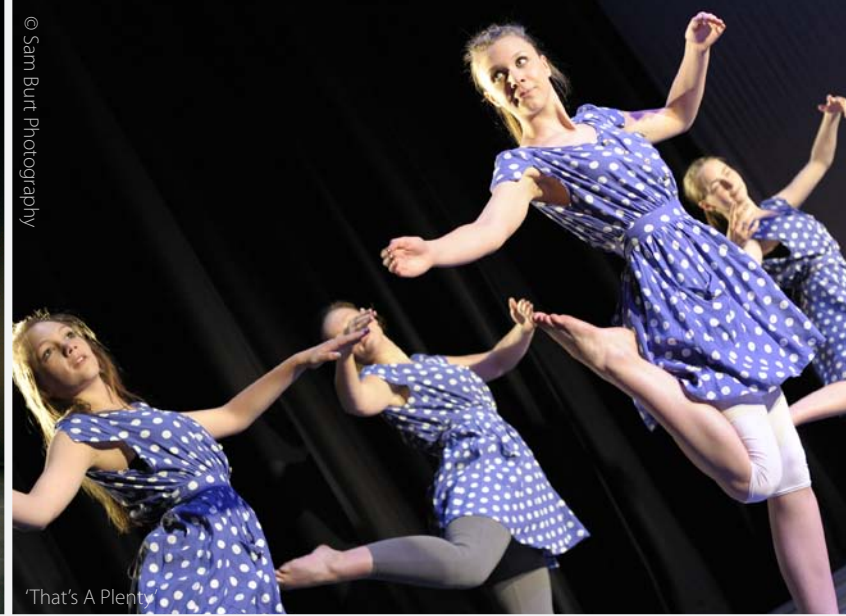
'That's A Plenty'